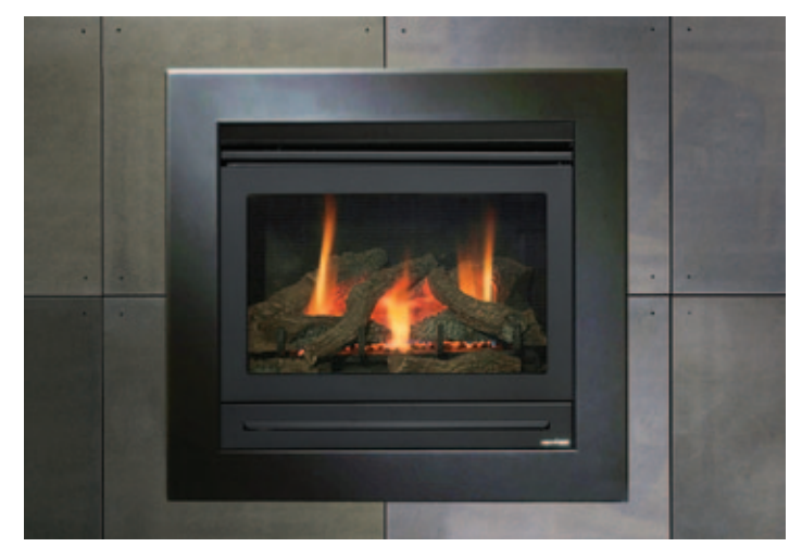
550TRSI with 4-sided black trim.