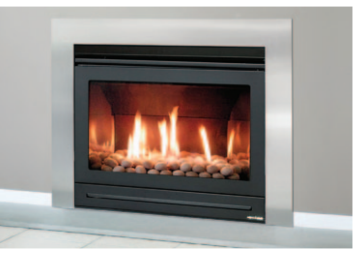
550TRSI pebbles with 3-sided stainless steel trim.