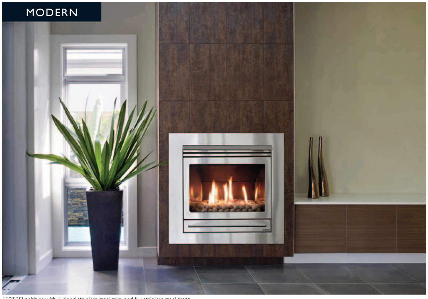
550TRSI pebbles with 4-sided stainless steel trim and full stainless steel front.