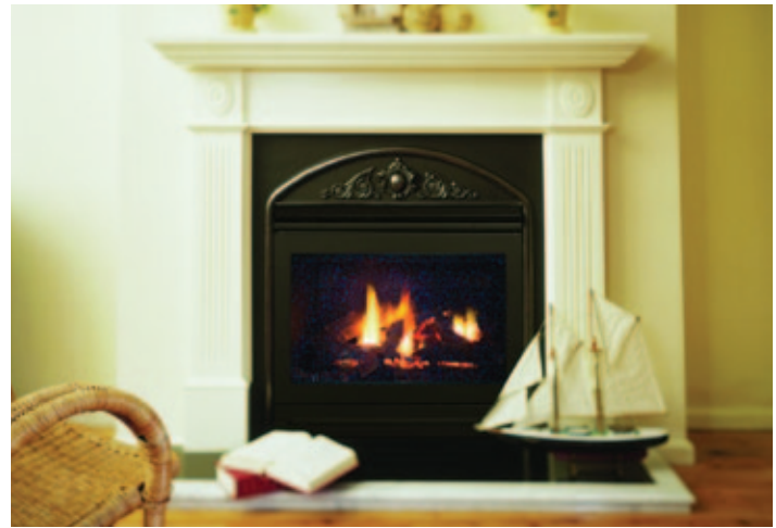
550TRSI with painted MDF Rosette mantelpiece, classic fascia and black granite hearth.