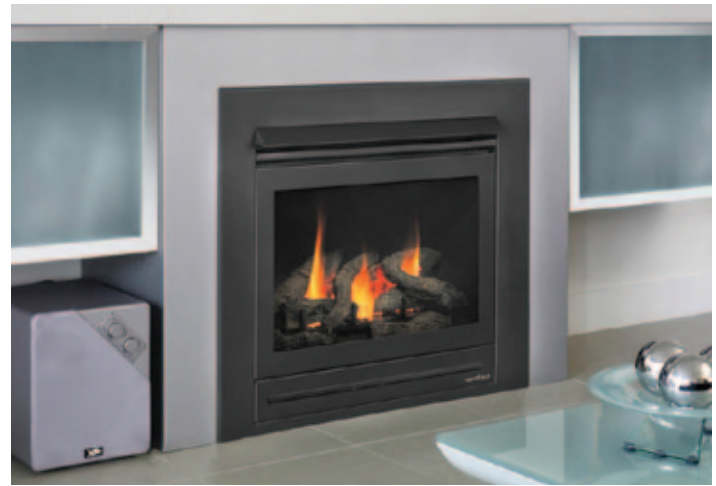
550TRSI with 3-sided black trim.