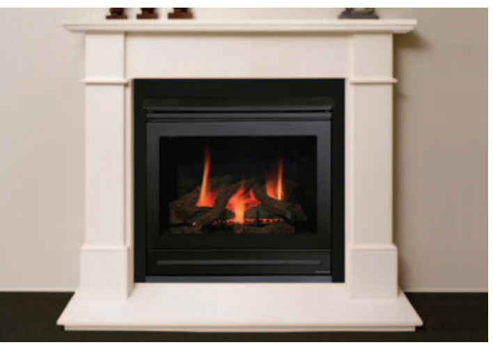
550TRSI with Brompton limestone mantelpiece and hearth with black trim.