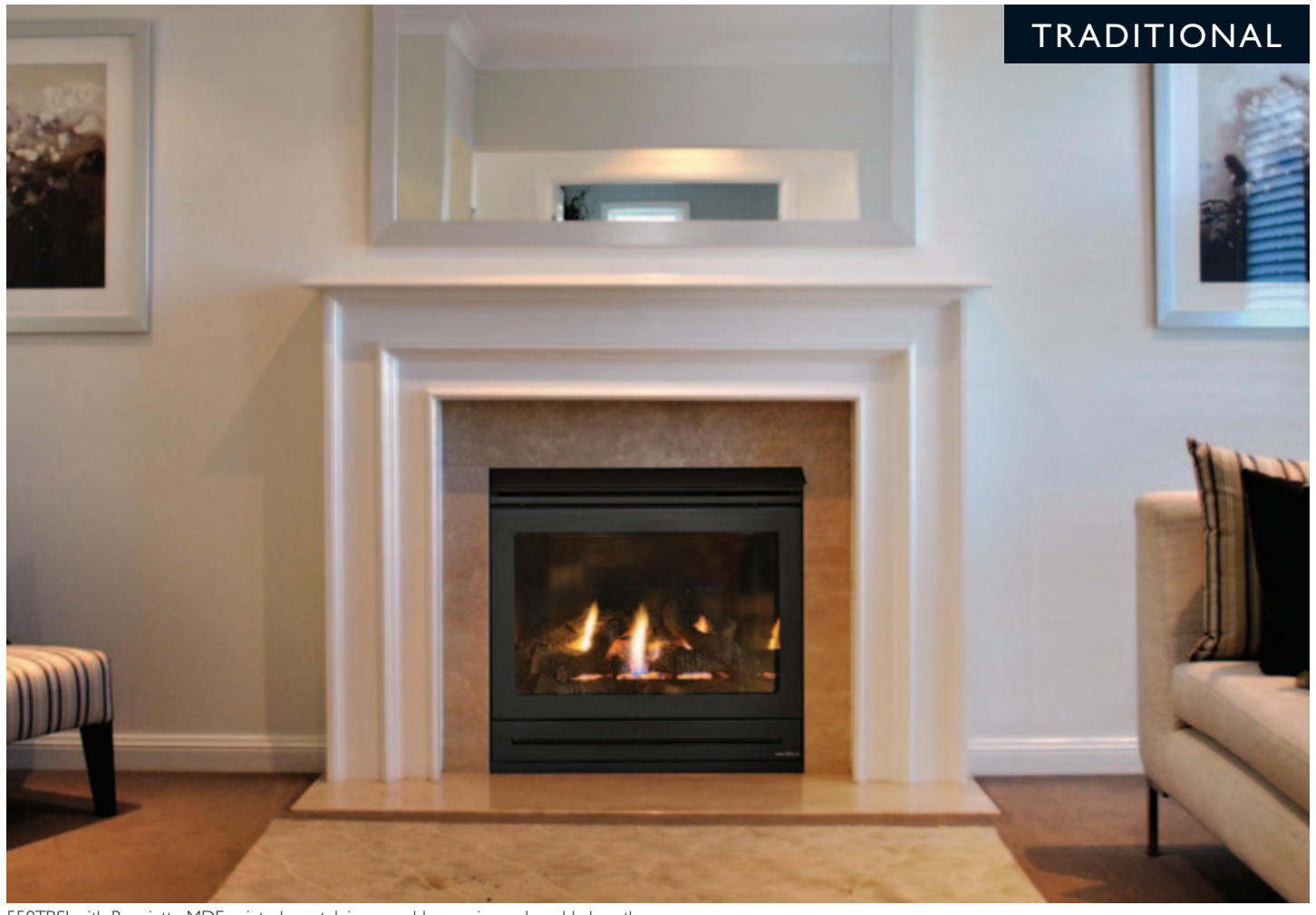
550TRSI with Bouviette MDF painted mantelpiece, marble margins and marble hearth.