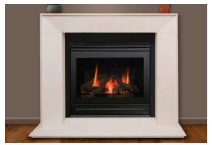
550TRSI with Marseilles limestone mantelpiece and hearth and black trim.