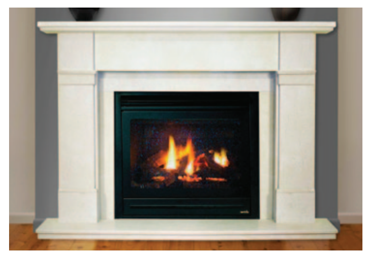
550TRSI with Crema Marfil Federation mantelpiece includes margins and hearth.