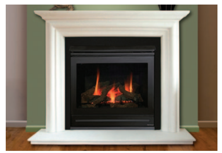
550TRSI with Modena limestone mantelpiece and hearth with black trim.